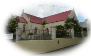
St. Luke Anglican Church Brighton, St. George