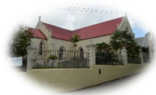
St. Luke Anglican Church Brighton, St. George