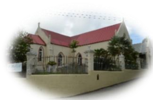
St. Luke Anglican Church Brighton, St. George