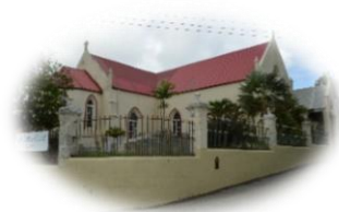
St. Luke Anglican Church Brighton, St. George