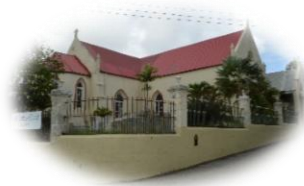
St. Luke Anglican Church Brighton, St. George