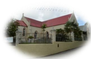
St. Luke Anglican Church Brighton, St. George