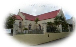
St. Luke Anglican Church Brighton, St. George